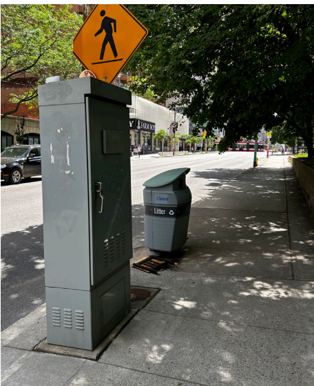
Location: St. Clair Ave. E. + Avoca Ave. Dimensions: W30” x D17” x H82”