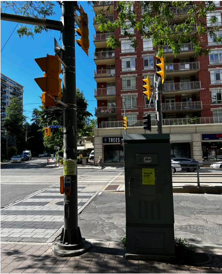
Location: St. Clair Ave. W. + Deer Park Cres. Dimensions: W33” x D18” x H82”