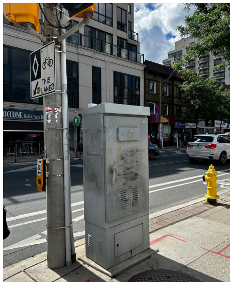
Location: Yonge St. + Rosehill Ave. Dimensions: W29” x D18” x H75”