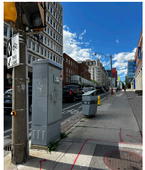
Location: Yonge St. + Woodlawn Ave. E. Dimensions: W33” x D18” x H82”