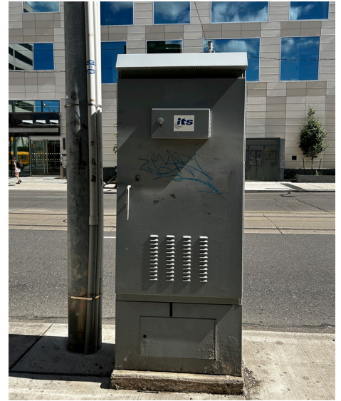
Location: St. Clair Ave. E. + Ferndale Ave. Dimensions: W33” x D18” x H82”