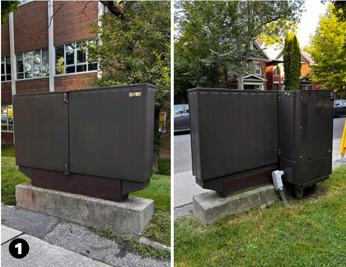
Location: St. Clair Ave. E. + Ferndale Ave. Dimensions: W79" x D20" x H53"