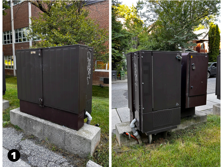
Location: St. Clair Ave. E. + Ferndale Ave. Dimensions: W58" x D27" x H53"